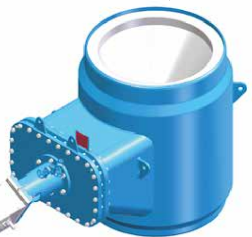
IMI Remosa cold wall single disc slide valve