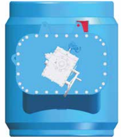
Cold wall single disc slide valve (Top view)